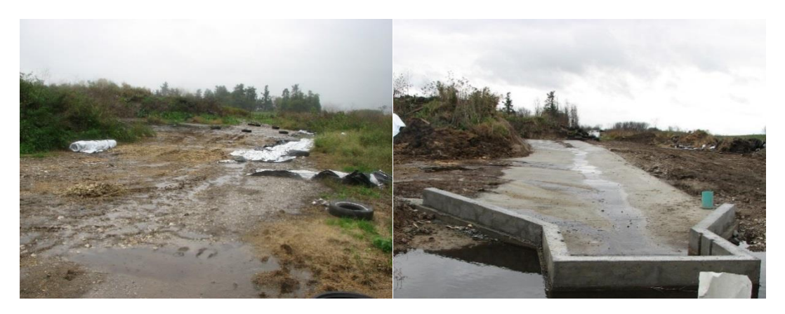
Figure 1. BMP for silage leachate collection system, before and after.